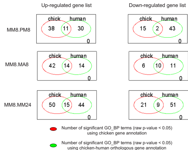
Figure 1 Comparison of GO term enrichment analysis results. Overlap of significantly enriched GO terms (raw p-value < 0.05) between the uses of chicken gene information versus chicken-human orthologous gene information.

Performing the GO enrichment analysis using chicken-human orthologous genes, on one hand, extensively increased the coverage of the gene annotation of this chicken oligo array platform. Consequently, this increases the power of the hypergeometric test by having more annotated genes in the DE gene lists. On the other hand, care has to be taken by using this approach, as human and chicken are evolutionarily far apart. Therefore, some of