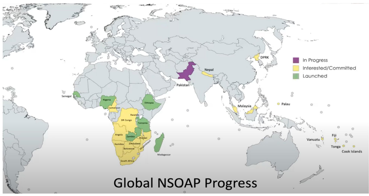
Fig. 2 Global NSOAP progress (as of October 2021) [8]

Figure 2 depicts the geographic distribution of countries engaging in the NSOAP process as of October 2021. The LCoGS outlined the domains that an NSOAP should address: